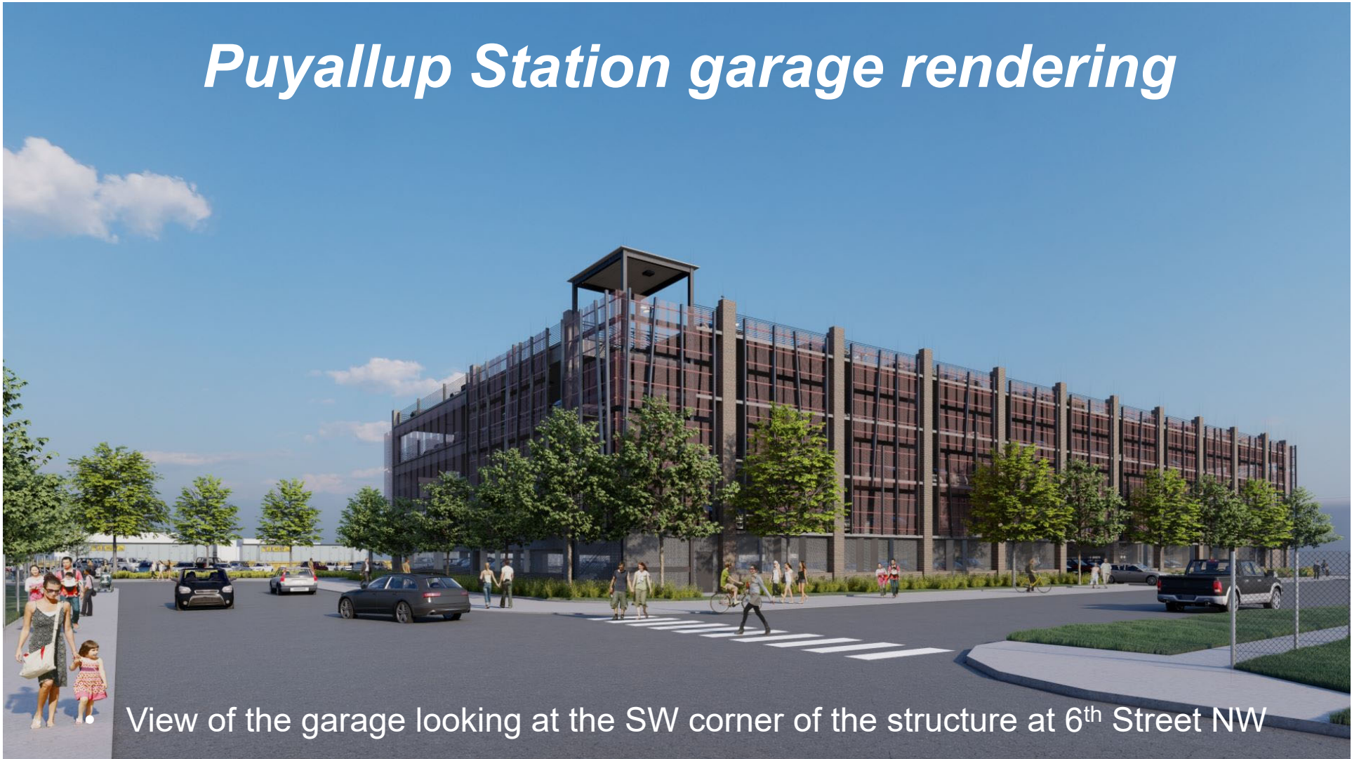
• View of the garage looking at the SW corner of the structure at 6 th Street NW