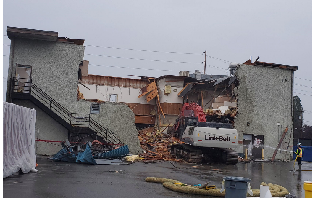
Demolishing on-site structures