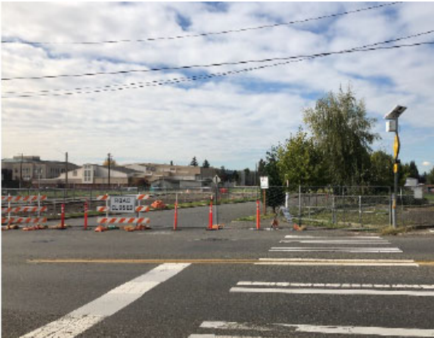
Closing Vacated 3 rd Ave NW